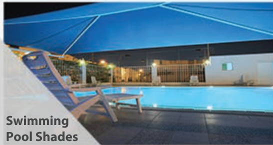
Swimming Pool Shades

SWIMMING POOL SHADES GARDEN & PLAYGROUND SHADES TENSILE MEMBRANE FABRIC