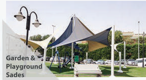
Garden & Playground Sades

We have swimming pool shades with different shapes and distinctive designs, we have taken the consumers gusto into our consider and as well as the shade site for the sun movement, in addition we give him free advices and we offer him the appropriate design of his shade according to their location.